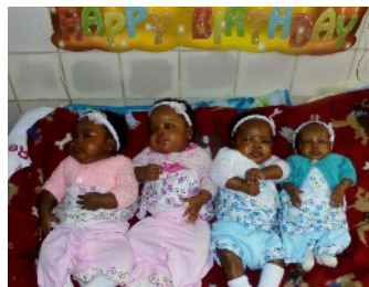
3 months old and growing fast!