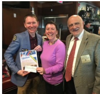
Rotary Club of The Palisades