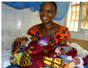
Welcome to the world little ones

https://www.justgiving.com/campaigns/charity/freedomfromfistulafoundationusinc/mabintysmiracles or by sending a cheque to: Freedom from Fistula, 777 United Nations Plaza, 8 th Floor, Suite 8-B, New York, NY10017