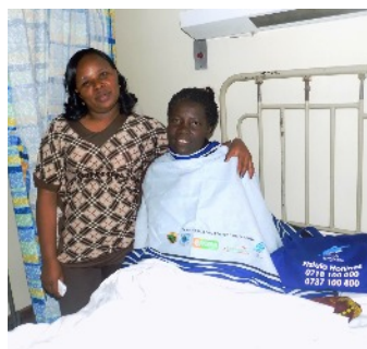
Esthers' life transformed