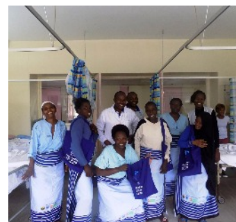
Patients preparing for home