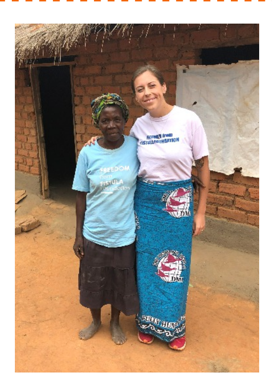
"Come again and see how I have progressed in life. I am already rich!"